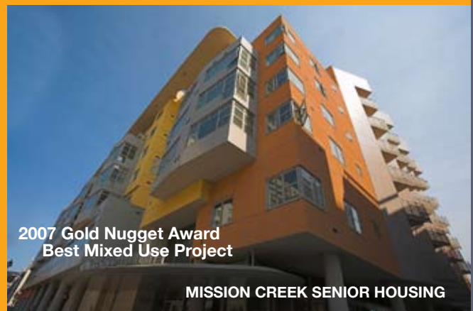
2007 Gold Nugget Award Best Mixed Use Project

SF AIA Design Honor Award, Energy & Sustainability FOLSOM / DORE APARTMENTS