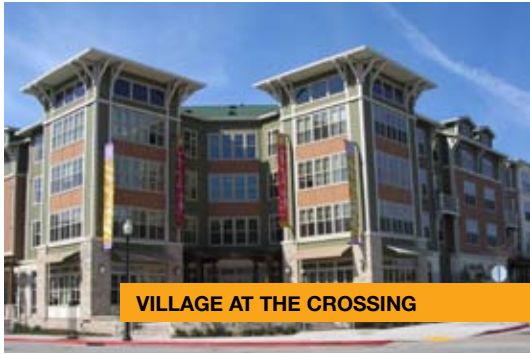
VILLAGE AT THE CROSSING

Construction of 228 affordable senior units. Building shaped like a figure eight with two courtyards on the podium.