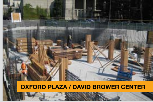
OXFORD PLAZA / DAVID BROWER CENTER

Owner: The Salvation Army Architect: Herman and Coliver Architects Address: 240-242 Turk St. San Francisco Construction: 4/2006 – 7/2008