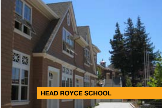
HEAD ROYCE SCHOOL

Owner: The David Brower Center Resources For Community Development City of Berkeley Architect: Solomon ETC Address: 2200 Oxford St. Berkeley Construction: 4/2007 – 3/2009