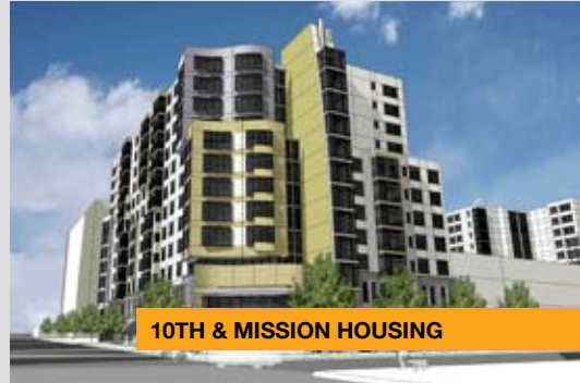
10TH & MISSION HOUSING

Owner: Head Royce School Architect: John Malick & Associates Address: Oakland Hills Construction: 7/2006 – 8/2008