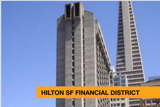
HILTON SF FINANCIAL DISTRICT

Owner: De La Salle High School Architect: Ratcliff Address: 1130 Winton Drive Concord Construction: 6/2005 – 9/2006