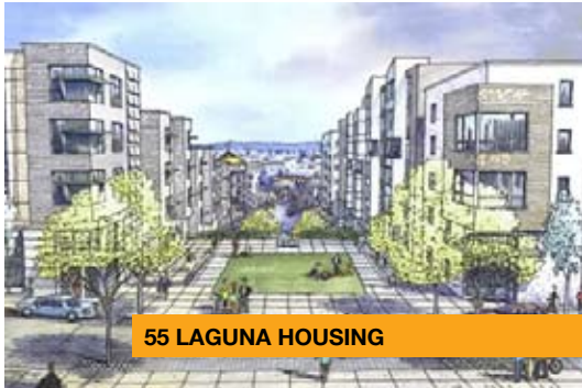
55 LAGUNA HOUSING

New construction and seismic upgrade/major renovation of 2 city blocks of market rate apartments.