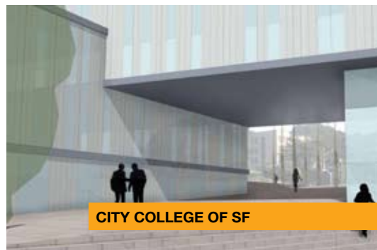
CITY COLLEGE OF SF