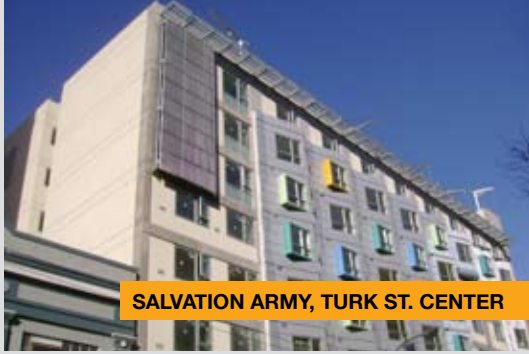
SALVATION ARMY, TURK ST. CENTER

Construction of 113 studio and two bedroom apartments over a community center. Includes a pool, gymnasium, locker room facilities, a chapel, a kitchen, aerobic & dance studios, several classrooms and some office spaces.