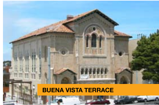
BUENA VISTA TERRACE

Owner: KDF Communities Architect: Kwan Henmi Address: Commodore Drive and National Ave. San Bruno Construction: 7/2005 – 2/2007