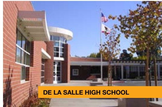
DE LA SALLE HIGH SCHOOL

Owner: Dominican University of California Architect: TWM Architects and Planners Address: 1425 Grand Ave. San Rafael Construction: 3/2006 – 9/2007