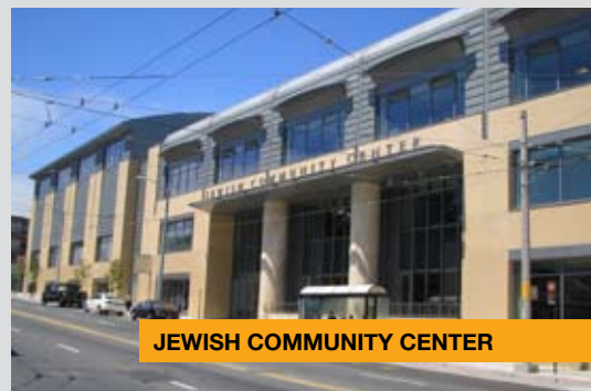
JEWISH COMMUNITY CENTER

Owner: Mercy Housing California San Francisco Public Library Architect: HKIT Santos Prescott Address: 201 Berry St. San Francisco Construction: 5/2004 – 5/2006