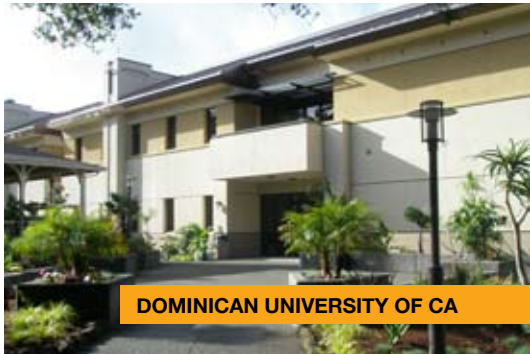
DOMINICAN UNIVERSITY OF CA

Owner: Citizens Housing Corporation Architect: HKIT Address: 1250 Haight St. San Francisco Construction: 12/2005 – 7/2007